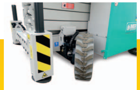
Reduced steering angle thanks to 70° wheel inclination