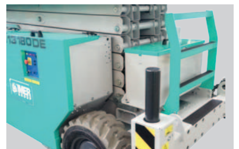
Second external battery pack for DE version