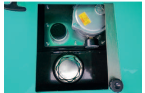
Sliding opening for filling fuel without the need to open the side hood