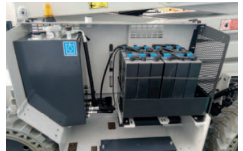
Second battery pack and oil storage