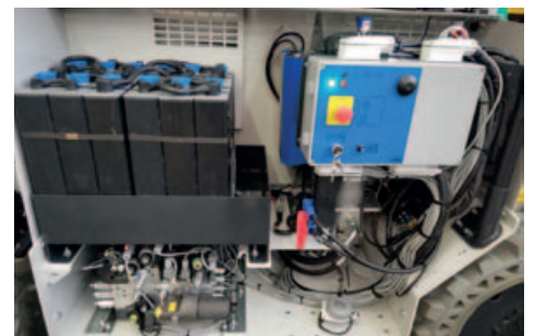
Control box and main battery pack