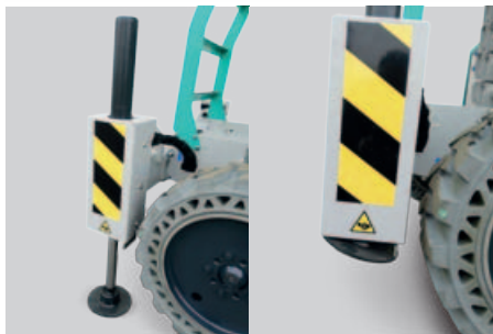
Automatic hydraulic stabilization system