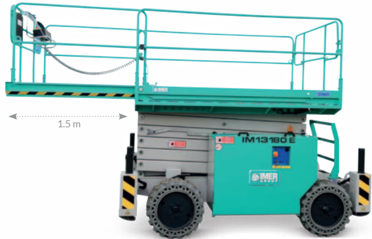
Manual deck extension of 1.5 m for a total length of 4.2 m