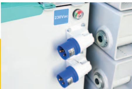
Plug unit for battery charger and power supply on basket with battery level indicator (E and DE versions)