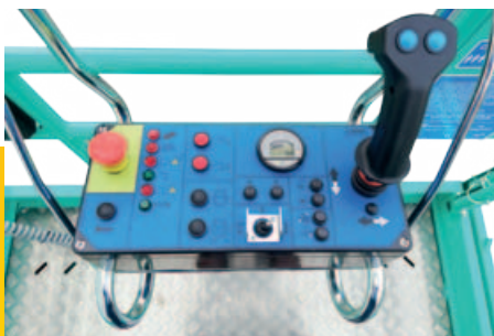
Simple and intuitive control box that can be removed from the basket for loading / unloading the machine